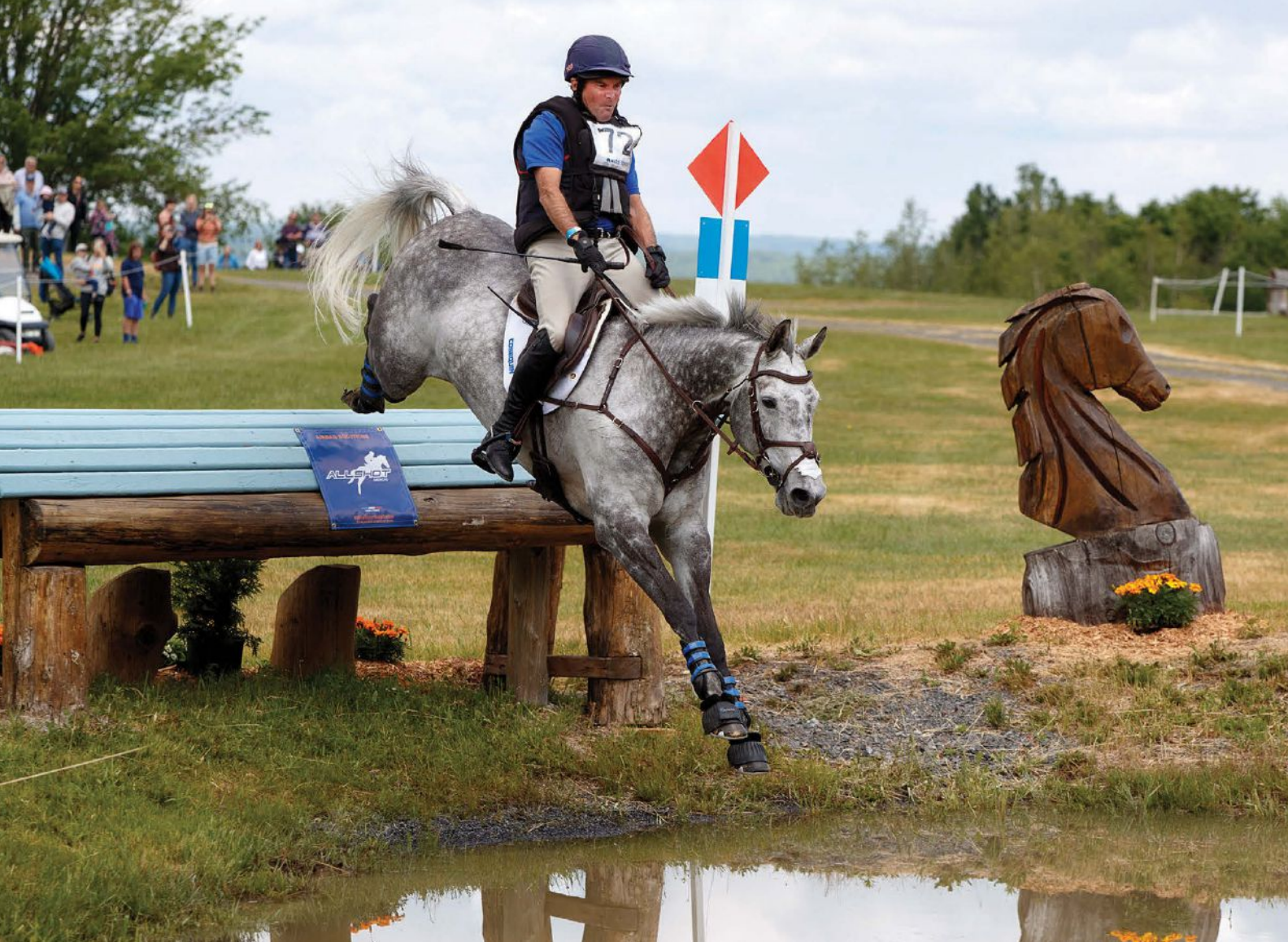
Azure, ridden by Phillip Dutton, earned her first FEI win at the Mars Equestrian Bromont Three-Day Event in the CCI4*-L.